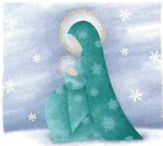
In his Mother's Arms

With best wishes for Christmas and the New Year