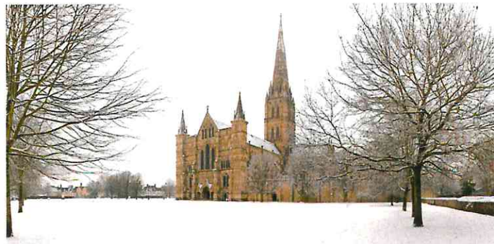
Salisbury Cathedral in the snow

With best wishes for Christmas and the New Year